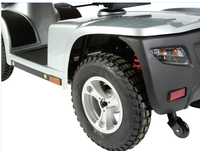
Alloy wheels with black pneumatic tyres for a smoother ride