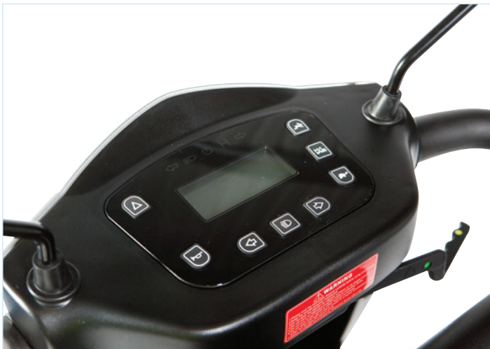
Backlit LCD illuminated controls