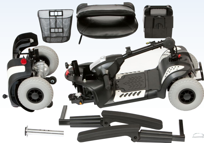
SPLITS EASILY FOR TRANSPORTATION & STORAGE

The Prism Sport is ideal for use indoors and outdoors where the terrain is forgiving (eg. smooth paths, shopping centres, etc). The Prism carries the Mercury brand, this ensures a focus on Comfort, Style, Performance and Reliability.